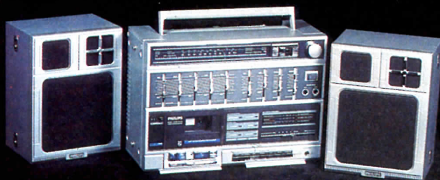
▲ FIRST PRIZE