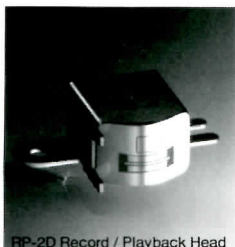
RP-2D Record / Playback Head

With over 30 years' of experience in magnetic design, Nakamichi is uniquely qualified to create an R/P head that rivals the performance of most 3-head designs in frequency response and freedom from distortion. In fact, few 3-head decks match the BX-125E/BX-100E's smooth response from 20 Hz to 20 kHz—a smoothness that guarantees freedom from sonic coloration.