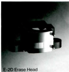
E-2D Erase Head

The RP-2D's laminated-sandust core makes full use of metal tape's recording potential while its 1.2-micron gap resolves 20-kHz wavelengths in playback. Hyperbolic geometry minimizes "contour effect" for smooth bass response. The E-2D's dual-gap design and low-loss ferrite core ensure complete erasure of metal tape.